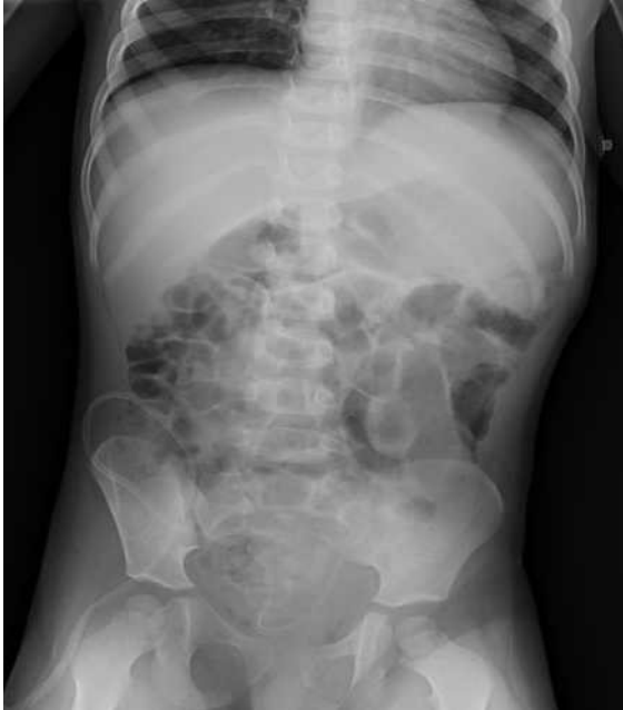
Fig. 4. Plain abdominal radiograph taken after surgery.

surgery [Fig. 4]. The patient is undergoing regular clinical, radiological, and laboratory follow-up for six months, and his general health status is good.