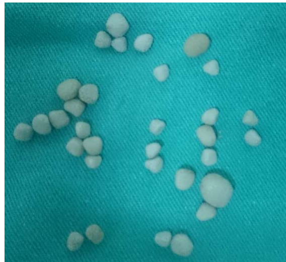
Fig. 3. Removed multiple stones from the ureterocele.

Next, the left ureter underwent the Politano-Leadbetter re-implantation technique. Analysis of the stones showed that their composition was calcium oxalate. In addition, the patient dropped the left kidney stones by the urethral route within one month after