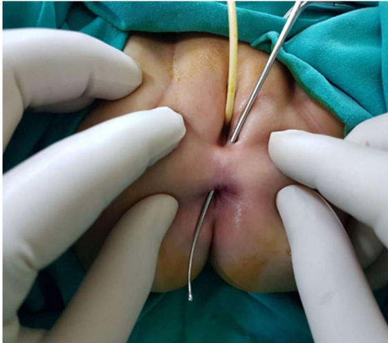
Fig. 2. Case 1, H-type rectovestibular fistula, the Hegar dilator crossing the tract and the two openings of the fistulous tract are shown.