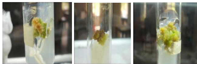
Fig. 1 : Callus from leaf explants of different cultivars

Explants produced profuse, friable callus within two to three weeks. Callus was transferred to fresh media after every two weeks depending on the rate of callus growth. The hormonal concentration of 2, 4-D [3.5mg/l] and kinetin [0.5mg/l] in combination produced profuse callus (Fig. 1 and 2). The percentage of callus induction was maximum in this concentration. The fresh weight obtained after culturing the callus in a culture tube was recorded. The maximum callus produced was in the combination of 2, 4-D+KN, 3.5+0.5 (83.11%) followed by 2, 4-D+KN 4.0+0.5 (79.37%) and 2, 4-D+KN.3.0 + 0.5 (77.73%). The fresh and oven dry weights obtained after culturing the callus in culture tubes was recorded and presented in Table 1. The callus production for leaf and nodal explants was almost similar. The same hormonal combination yielded callus in a similar manner for both leaf and nodal explants (Fig. 3).