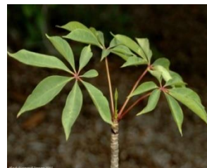
Figure.1. Bombax ceiba plant

Nanotechnology is facilitating technology which deals with nanometer sized items. The exercise of nano materials in biotechnology the fields of biology and material science. Nanoparticles put for a substantially useful platform, demonstrating unique properties with potentially wide-ranging application. Several research groups have oppressed the use of biological systems for the synthesis of nanoparticles, because of many rewards over non-biological systems The properties of nanoparticles can be derived from a variety of aspects, including the congruent size of nanoparticles and bimolecular, such as proteins and polynucleic acids. Synthesized by biogenic approach, nanoparticles present good polydispersity, dimensions and stability. The nanoparticles are synthesized. Nevertheless, in this method, capping agents are necessary for stabilization of the size of nanoparticles. Nanoparticles have been synthesized, most recurrently by three chemical techniques: a). Dispersion of preformed polymers, b). Polymerization of monomers, c). Ionic gelation or coacervation of hydrophilic polymers.