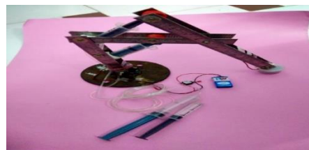
Figure.2. Pantograph Design