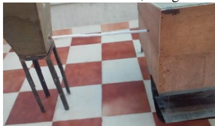
Figure.1. Photographic representation of Integration of Solar Still and Solar Pond

the water, thereby causing it to evaporate. Formation of water droplets occur inner side of the transparent cover, a collection tray was fixed in the inside surface of the glass cover to facilitate the deflection of the condensate return into the collection channel. The gliding water from the channel was transferred into the collection tank through the flexible hoses. The distillate output from the still was measured, using a collection tank.