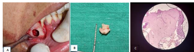
Fig. 2: Surgical and histological images. A: surgical access for apicoectomy with 45. B: cemental mass along with root portion. C: Histological evaluation displaying prominent basophilic reversal lines and cementoblastic rimming & numerous scattered multinucleated giant cells are seen.

45 & 46. D: Post surgical IOPA with 45. E: 6 months follow up IOPA with 45. F: 10 months follow up IOPA with 45. G: Axial view of CBCT buccal bone expansion with resorption. H: Axial view of CBCT showing faint communication seen between periapical lesions of 45 & 46.