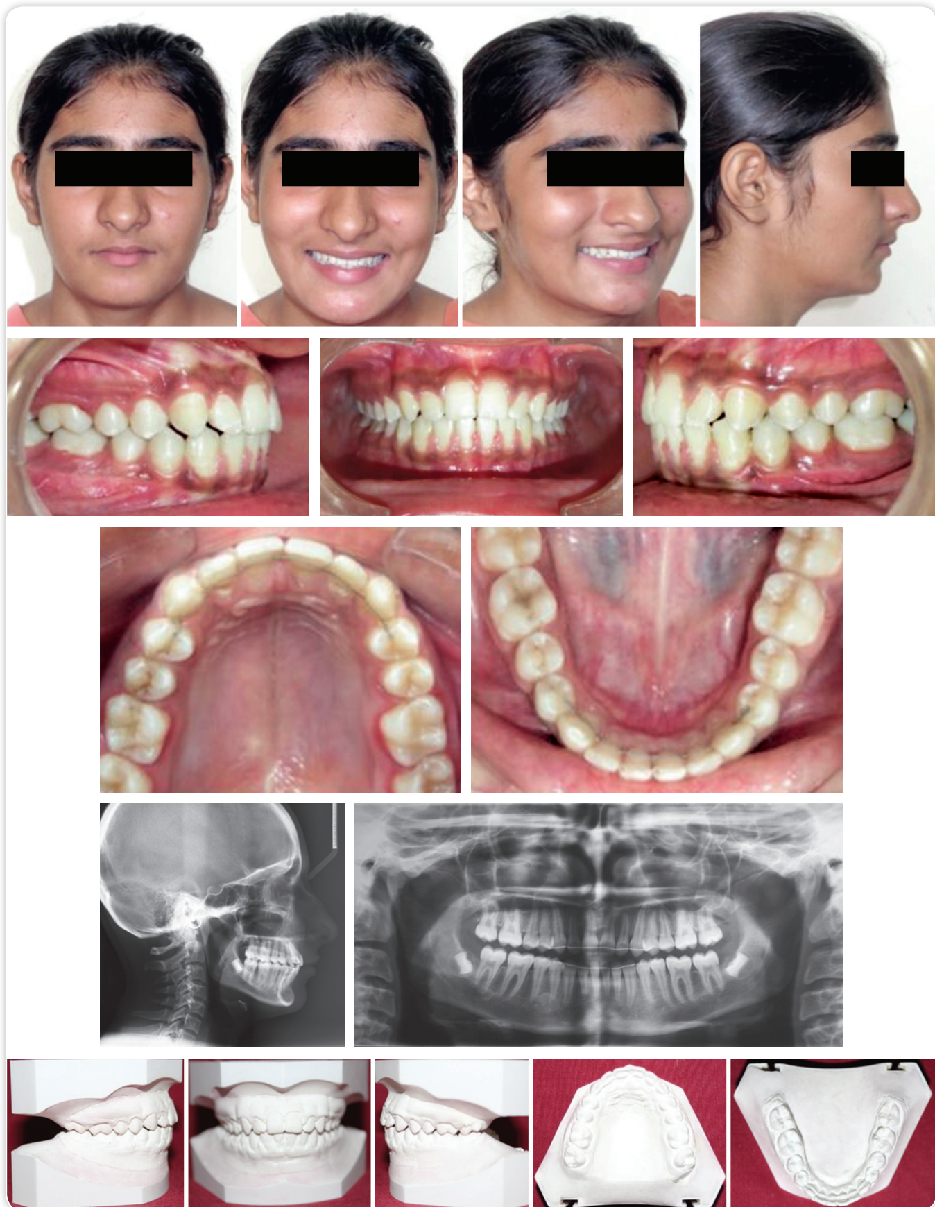
Figure 4 Post-treatment