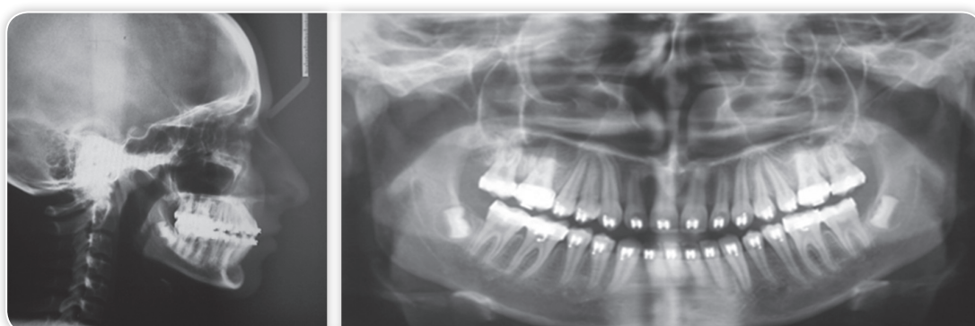
Figure 3 Mid treatment