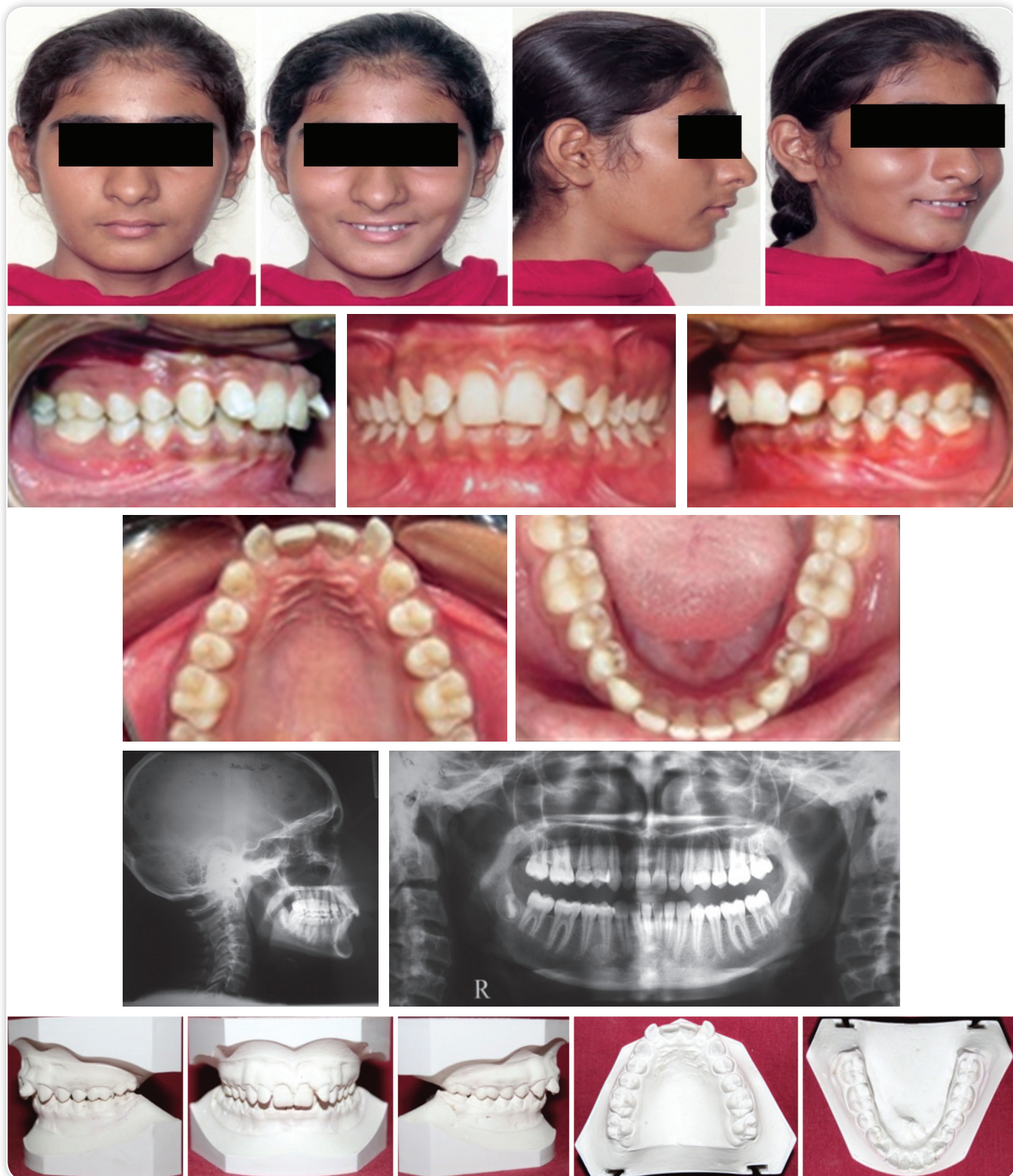
Figure 1 Pretreatment

The lateral cephalometric tracing showed a skeletal relationship slightly towards Class II relation with a horizontal growth pattern. The upper central incisors were retroclined