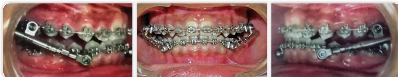
Figure 2 Installation of Powerscope for correction of class II relation

One year follow up record shown stable skeletal, dental and soft tissue esthetics and maintained overjet and overbite which achieved by fixed functional Class II corrector appliance POWERSCOPE™ (Fig. 6).