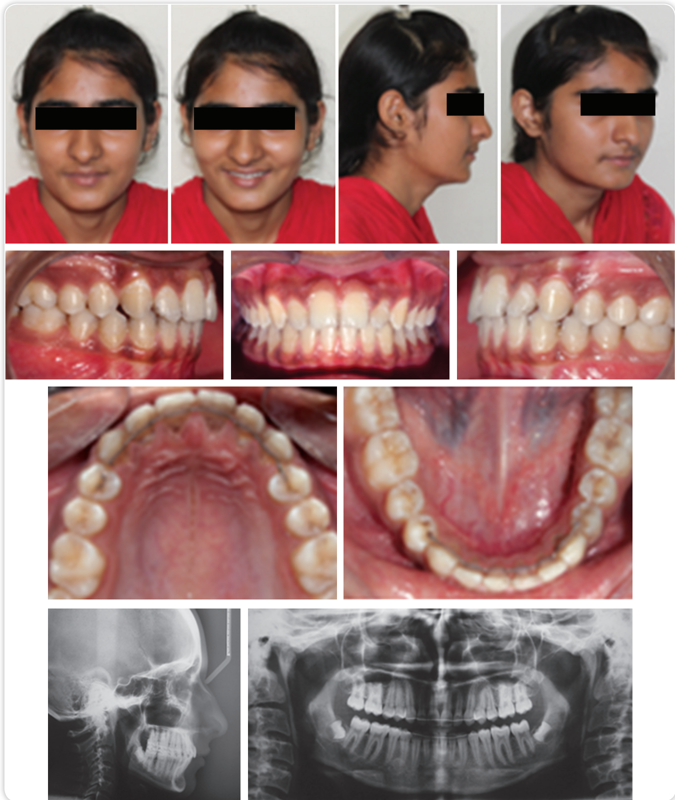
Figure 6 One-year follow up