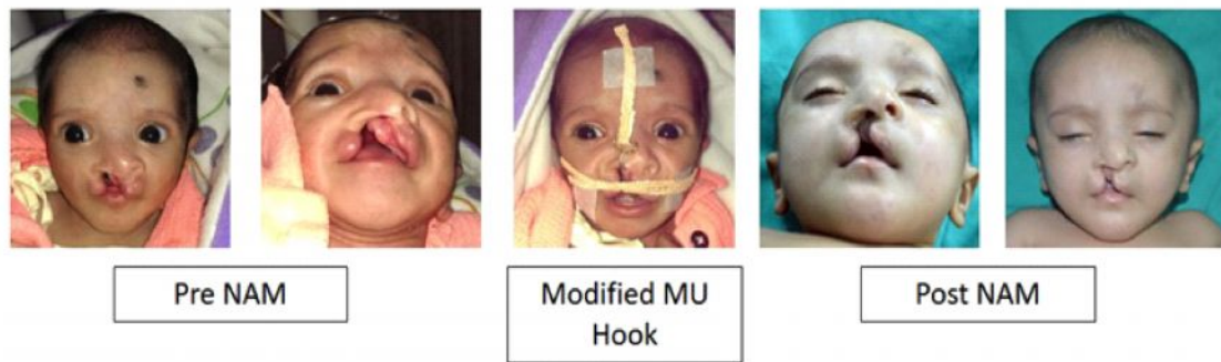
Case 1: Unilateral cleft lip and palate on the left side