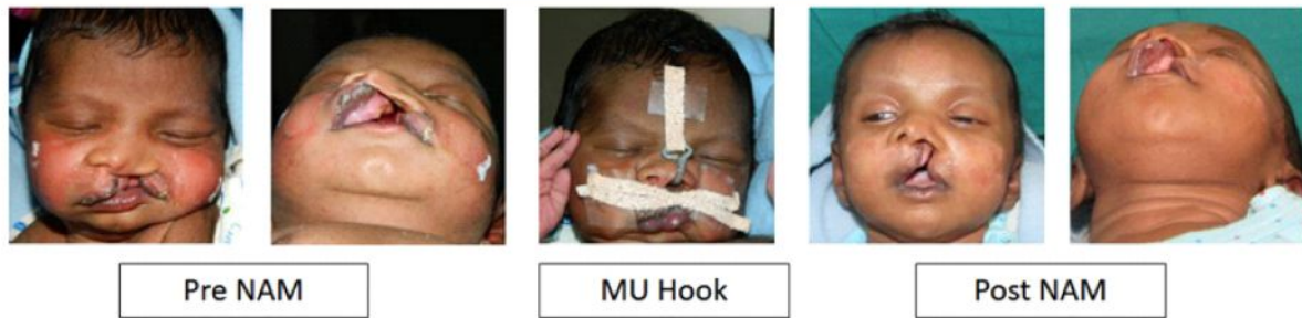
Case 5: Unilateral cleft lip and palate of the right side

One week old baby reported to the department. On Examination patient presented with a bilateral cleft lip and palate with collapsed nostril and insufficient columella. Patient's parents also reported a history of cardiac problems which necessitated the avoidance of any impression making procedures to elude the associated risks. Modified MU hook for bilateral cleft lip and palate with bifurcation was delivered to the patient without any need for impression. All nasal changes were appreciated post NAM with approximation of lip segments. (Fig 4)