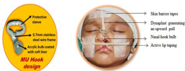
Figure 1 A:. MU Hook Design B. Insetion of MU Hook on patient