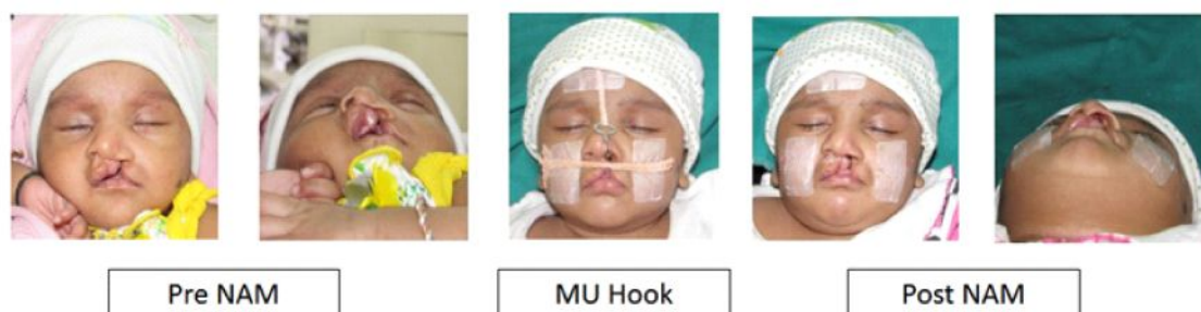
Case 4: Bilateral cleft lip and palate