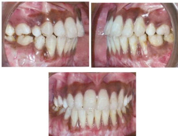
Figure F. Post treatment intraoral photographs