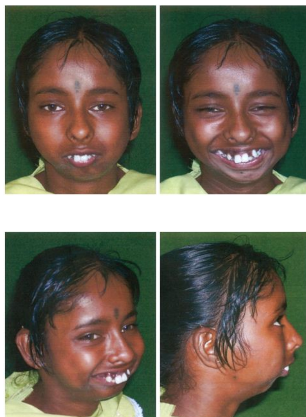
Fig A. Pre treatment Extraoral photographs

A 12 year old patient reported to the department of Orthodontics, SDM Dental College and Hospital, with chief complaint of facial asymmetry and backwardly placed jaw. The patient gave a medical history of TMJ ankylosis of left side for which she was operated a year ago. Surgical release of fibrous ankylosis with gap arthroplasty was carried out which improved the mouth opening. No family history of craniofacial deformities. The clinical and radiographic examination indicated right hemi facial microsomia with small temporomandibular joint and ramus.