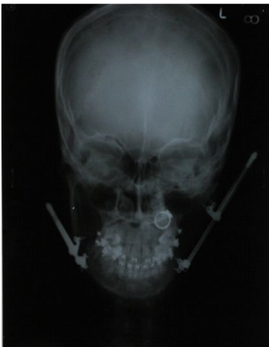
Radiographs showing placement of distractors