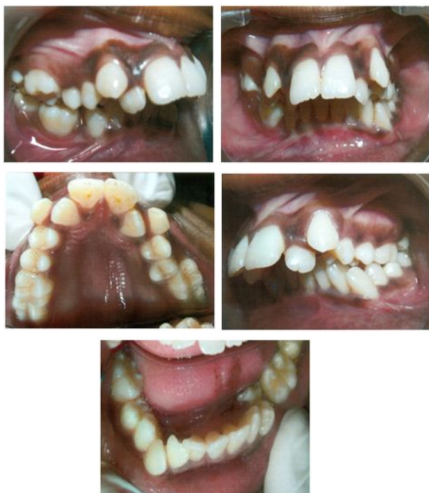
Fig B. Pre treatment intraoral photographs

The pre treatment photographs showed that her face was asymmetrical with a mildly undeveloped chin which was shifted to the left. In addition the lower facial height was decreased with proclined upper anteriors and incompetent lips. In profile view, a convex profile with retrusive chin was seen. (Figure A) The intraoral examination showed a V-shaped maxillary arch with upper anterior crowding with a midline deviation of 7mm to the left, a severe Class II canine and molar relationships, with an overjet of 15mm and an overbite of 6mm. (Figure B).