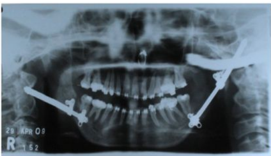
Radiographs showing placement of distractors