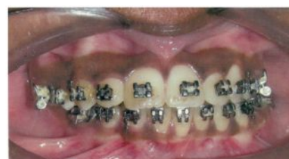
Figure D. Pre Surgical photographs