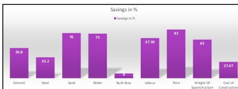
Figure.5. Histogram showing the comparative savings between rapid wall and conventional construction

The histogram given in Fig. 5 reveals a massive savings in materials, time, weight and cost due to Rapid wall adoption are as follows: cement (50.80%), steel (35.20%), sand (76%), water (75%), built area (8%), labour (67.59%), time (82%), weight of super structure (65%) and construction cost (27.47%).