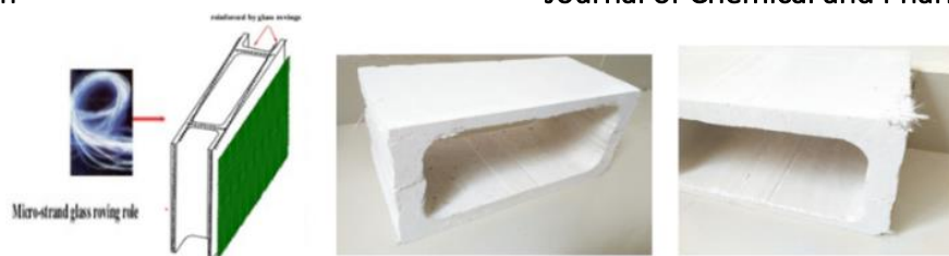
Figure.1. Rapid wall Panels reinforced with glass roving

There are 48 modular cavities of size 230mmx94mmx3m present for each panel. The weight of each panel is 40 kg/m 2 or 1440 kg. And its density is 1.14g/cm 3 being only 10-12% weight of the brick/concrete masonry. A model Rapid wall panel is presented in Fig.1. The physical and material properties of panels are as shown in Table.1.