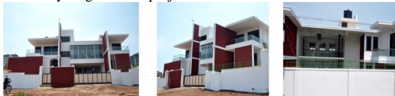
Figure.2. Rapid wall 2 storeyed Residential building at Manipal

Some Case Studies: Rapid wall is being used magnificently for the construction of different types of buildings including buildings up to 10 storeys high. A few projects mentioned below are successfully executed in India.