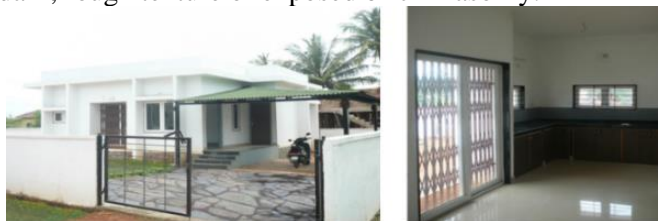
Figure.3. Rapid wall Residential building at Mumbai

A two storeyed building constructed for residential purpose in 2013 in Manipal (Fig.2). It has 5 bedrooms and parking provided in the ground floor. The wall panel erection was completed in 30 days. It is given an elegant look outside by the usage of dark, rough texture of exposed brick masonry.