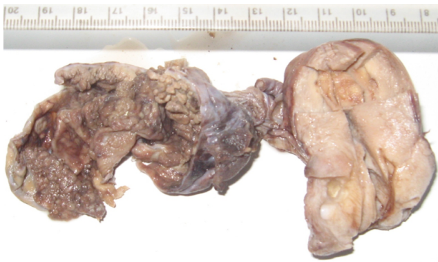
Fig. 1: Grossly, no evident intrauterine tumor with only foci of adenomyotic patches in the myometrium of the uterus, with unremarkable endometrium is seen. The right ovary is enlarged, 10x 9.2 cms in size, with solid to cystic growth with papillary configurations.

Microscopically, tissue sections showed closely packed glands lined by columnar epithelium with hyperchromatic basal nuclei, with minimal intervening stroma with foci of papillary configuration of tumor cells. Extensive areas of haemorrhage and necrosis was also noted with no lymphovascular invasion. (Figure 2). Immunohistochemical analysis showed the tumour cells reactive strongly with epithelial membrane antigen (Figure 3) and pancytokeratin and focally reactive with vimentin. A final diagnosis of endometrioid-type ovarian adenocarcinoma was given. Our patient was administered combination adjuvant chemotherapy of 6 cycles of 50 mg/m 2 of carboplatin and 50 mg/m 2 of paclitaxel. Our patient is doing well after 12 months of follow up.