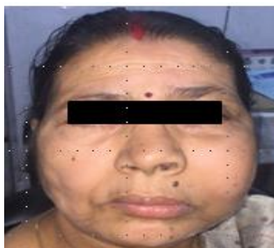
Fig. 2: Facial profile picture showing extension of swelling

A provisional diagnosis of Adenoid cystic carcinoma was arrived at with the differential diagnosis including: Carcinoma of alveolus, low grade malignancy involving maxillary sinus and mucoepidermoid carcinoma.