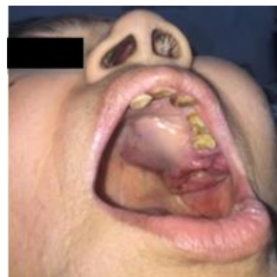
Fig. 3: Intra-oral picture showing swelling extending from left central incisor to hard palate not crossing midline