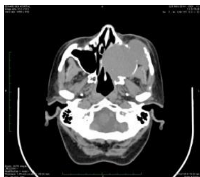
Fig. 7: Axial section of contrast enhanced computed tomography scan showing extent of swelling

4.6x5.68x 6.1 cm sized well defined, expansile, solid infiltrative mass lesion, centred in left maxillary sinus was noted. Medially mass was eroding/destroying right lateral nasal wall (medial wall of left maxillary sinus), extending into left nasal cavity and displacing the nasal septum towards right. The mass showed intragenous enhancement with central hypodense. Posteriorly and posterolaterally mass was eroding sinus wall and left pterygoid plate. It was extending into left pterygopalatine fossa and masticator space. Anteriorly and anterolaterally mass causing, sinus wall and left zygomatic bone erosion. Superiorly mass was eroding left orbital floor, with infraorbital extension. It was also showing close area of contact with left medial and inferior rectus muscle with loss of fat planes. Inferiorly mass was eroding left half of palate and lateral aspect of left superior alveolar ridge. Enlarged level I, bilaterally level II nodes were noted (nodes measuring <6 cm in greatest dimension). Nasopharyngeal and oropharyngeal air column appeared normal. No intracranial extension of mass was noted. These findings were suggestive of neoplastic malignant etiology lesion (carcinoma maxilla) likely T 4a N 2 . Stage IV A . Histo pathological correlation was suggested.