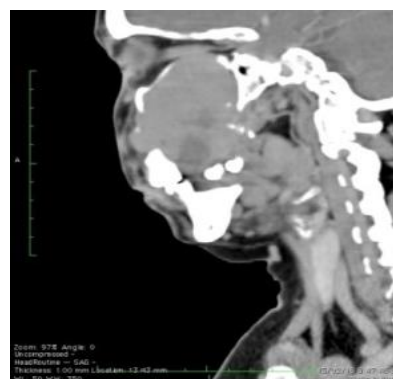
Fig. 5: Sagittal section