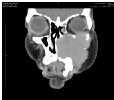
Fig. 6: Coronal section