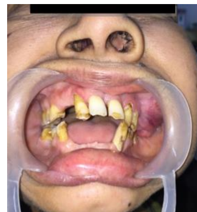
Fig. 4: Intra-oral picture showing swelling hindering occlusion

A complete hemogram, blood glucose estimation, orthopantomograph (OPG) [Fig. 4], chest x-ray and CECT (Contrast Enhanced Computed Tomography) scan [Fig. 5, 6 & 7] were advised. All the parameters of the hemogram and blood glucose estimation were within the normal range. OPG showed destructive lesion causing resorption of upper premolar root and the surrounding bone also involving the walls of left maxillary sinus. Chest x-ray showed no pleural or parenchymal abnormalities.