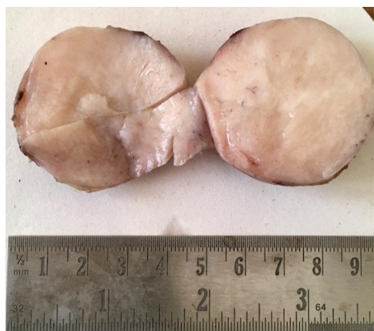
Fig. 1: Gross appearance showing a partially encapsulated grey white to grey brown tumor. Cut surface is homogenous with slit like areas

myoepithelial layer. Histopathological features were compatible with fibroadenoma.