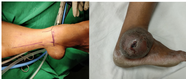
Fig. 1: Local area photo showing swelling