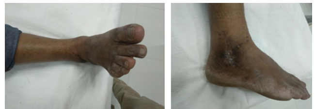
Fig. 5: Post-operative clinical picture