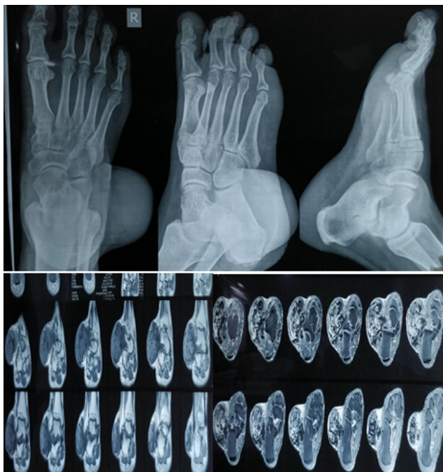
Fig. 2: Plain radiograph of ankle showed shadow of the swelling and confirmed that the swelling was not bony