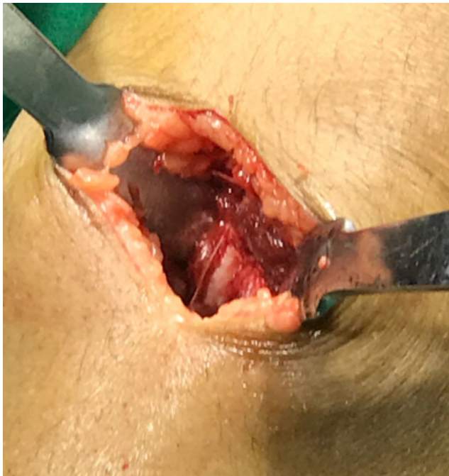
Fig. 2: Showing exposure of fibula