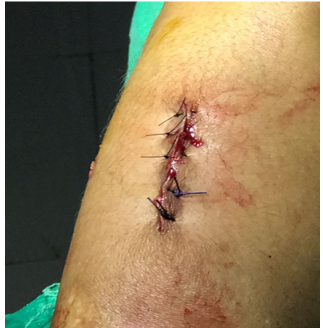
Fig. 4: After closure of wound