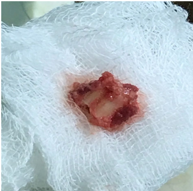
Fig. 3: Showing excised piece of fibula