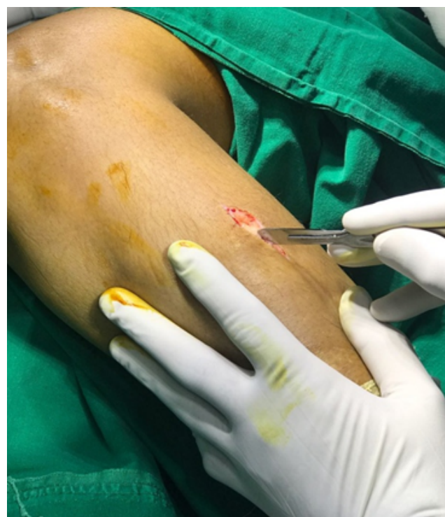
Fig. 1: Showing incision

The mean knee and function subscores were (American Knee Society score) .