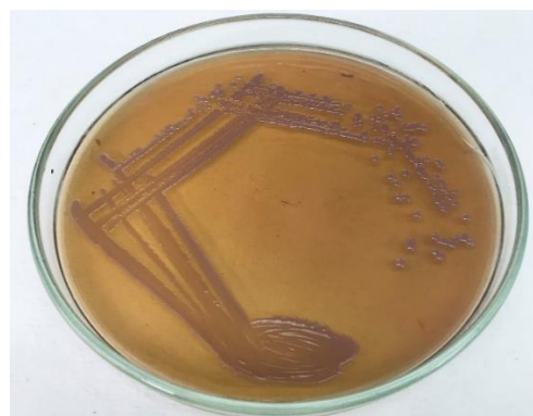
Fig. 1: Colonies of Serratia marcescens on MacConkey agar

levofloxacin, ofloxacin, trimethoprim-sulfamethoxazole and cefoperazone-sulbactam. It showed intermediate susceptibility to piperacillin-tazobactam and was resistant to ampicillin, amoxycillin-clavulanic acid and second generation cephalosporin. No other pathological investigations were done. Patient was treated with one gram cefotaxime twice a day for five days intravenously and dressing of the site was done. She responded to this treatment.