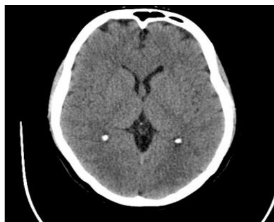
Fig. 1: Normal NCCT Head

Diagnostic laryngoscopy with biopsy was done and on histopathological examination, it was squamous cell carcinoma moderately differentiated type. Patient underwent total laryngectomy with chemoradiation.