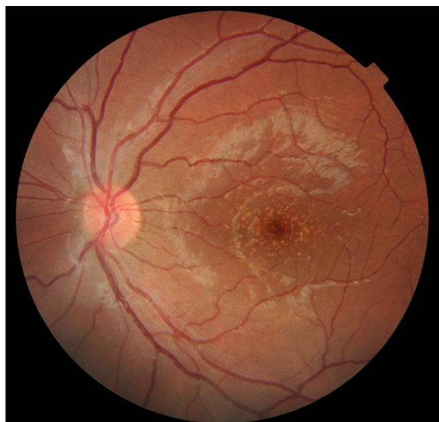
Fig. 3: Fundus photo showing DLDs in a patient with CKD.

Glomerulonephritis is associated with electron dense deposits in the lamina densa of glomerular basement membrane. Choroid and kidney are anatomically similar as both have a large capillary bed with fenestrated vessels. Thus, such deposits can also occur at the level of Bruch's membrane. 17 Also, CKD is known to accelerate the progression of atherosclerosis and increase propensity to oxidative stress, both of which are implicated in AMD pathogenesis. 18