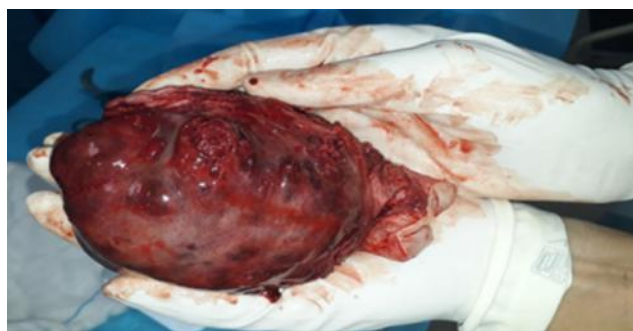
Fig. 1: Total hysterectomy specimen of case 2