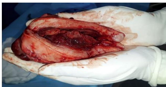
Fig. 2: Cut section of uterus showing GTD