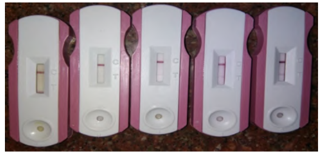
Fig. 4: Showing positive hcg urine pregnancy test on diluting the urine of a patient with GTD