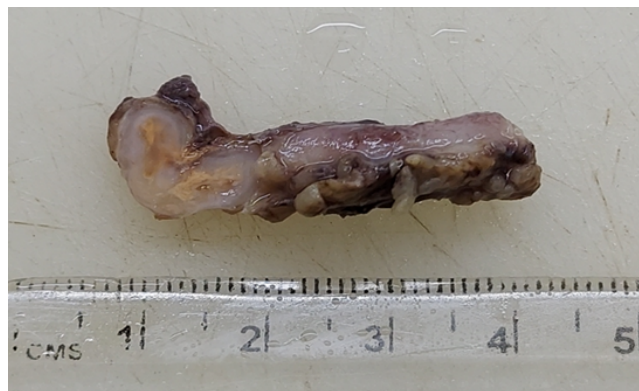
Fig. 1: Inflamed appendectomy specimen measuring 4x0.5cm. No perforation or gangrenous change notes. Outer surface is dull and congested

Based on H&E examination, a diagnosis of Xanthogranulomatous Appendicitis was made.