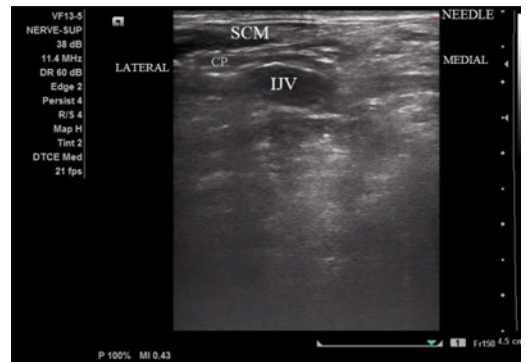
Figure 3: Superficial cervical plexus block after drug placement