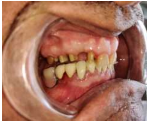
FIG 7- MAXILLARY TOOTH PREPARATION