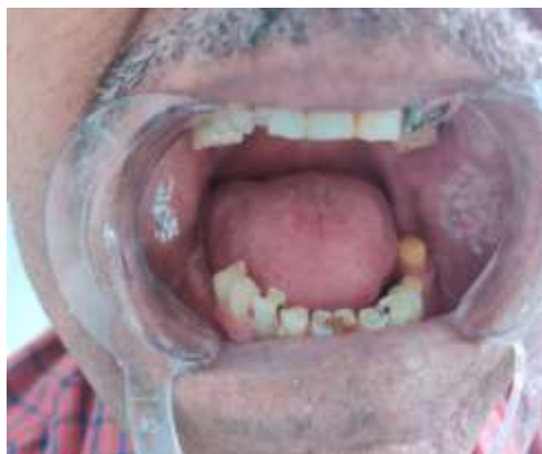
FIG1-PRE-OPERATIVE INTRAORAL VIEW