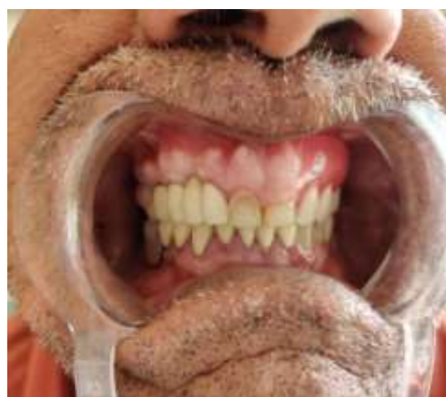
FIG 11- IN OCCLUSION