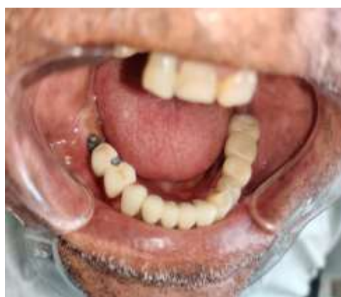
FIG 4-TRY IN OF THE MALE SECTION