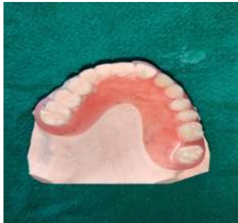
FIG 9- FLEXIBLE DENTURE