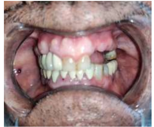
FIG 8- CEMENTED FPD AND CROWNS