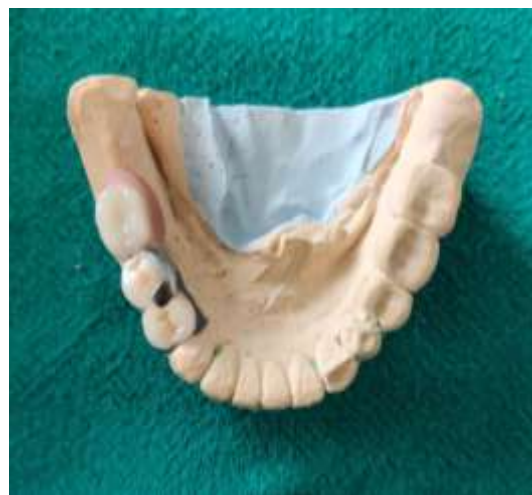
FIG 6- BOTH MALE AND FEMALE SECTION IN THE CAST