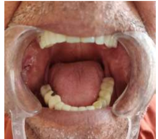
FIG 10-POST OPERATIVE