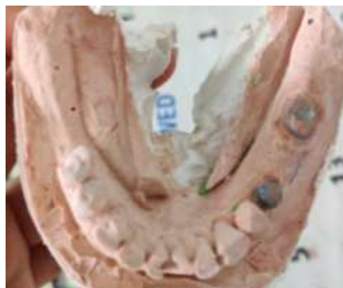
FIG 2- DIAGNOSTIC CAST