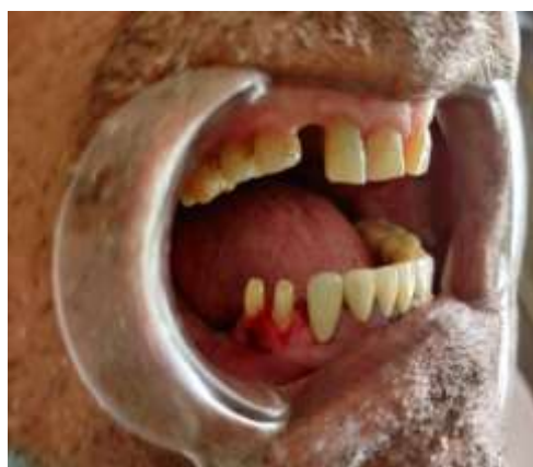
FIG 3- ABUTMENT PREPARATION IN 44,45