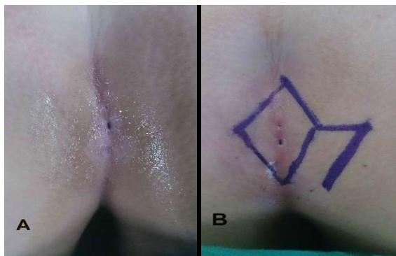
Fig. 1. A) Preoperative view of pilonidal sinus. B) Romboid-Flap (Limberg).

injecting methylene blue and palpation. Firstly, the area within the pilonidal sinus borders was marked as described in the original Limberg flap technique [Fig. 1A, B].