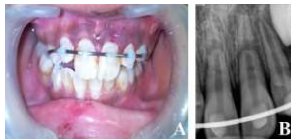
Figure 2: A) Stabilisation with composite wire splint; B) Radiograph after splinting

The treatment started with cleaning of the intraoral and extraoral lacerations followed by immediate repositioning of the extruded coronal fragments in the vertical direction with gentle finger pressure under local anesthesia. Splinting was carried out with composite wire splint for 2-4 weeks as recommended by Flores et al. 6 The position of teeth was verified radiographically and the patient was prescribed antibiotics and analgesics for three days. [Figure 2 A & B]