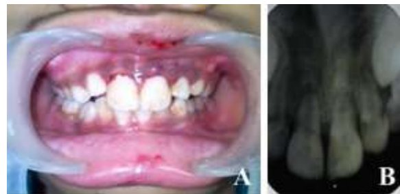
Figure 1: A) Preoperative intraoral view; B) Preoperative Intraoral Periapical Radiographic view

horizontal root fracture at the middle third region with separation of the fragments. [Figure 1 A & B]