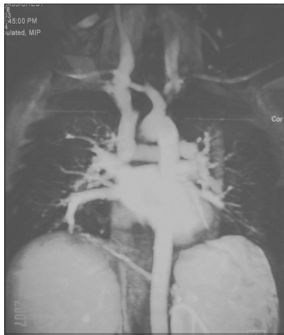
Figure 1: Thoracoabdominal aortography shows a large artery arising from the aorta at the level of D10-11, passing to the right and backward to supply base of the right lung and drained through the venous pulmonary circulation into the right atrium