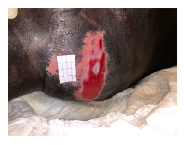
Fig. 1: Grade 2 pressure sore in the patient

The Pressure sore had healed and was entirely covered by dermis after two weeks (Figure 5). There was no indication that the ulcer was getting worse or that it had an infection. The ulcer site was entirely dry and there was no discharge.