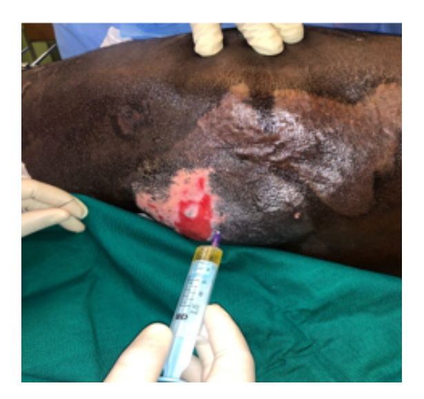
Fig. 3: Application of APRP at ulcer site