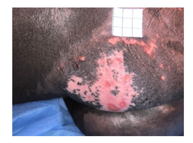
Fig. 5: Healed pressure ulcer