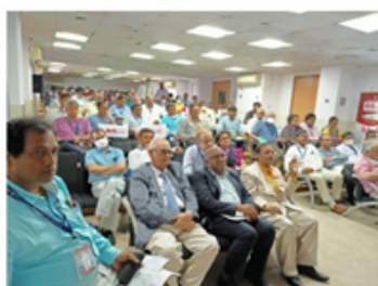
Faculties & Delegates