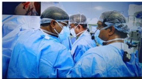
Live Surgical Workshop at ESIC Joka