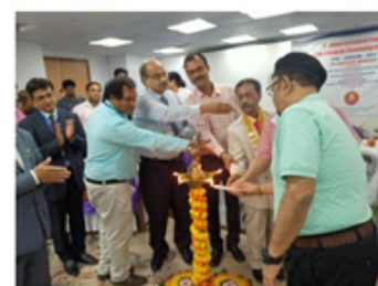
Glimpse of Inauguration of Pre-conference workshop