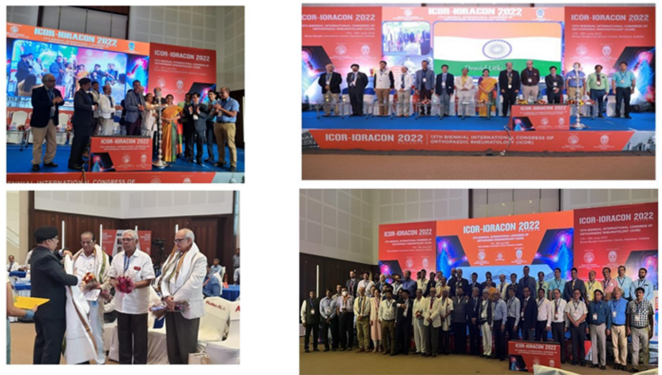
Fig. 2: ICOR-IORACON-2022-Kolkata; Inauguration & Felicitation of Patrons, Guests & Faculties