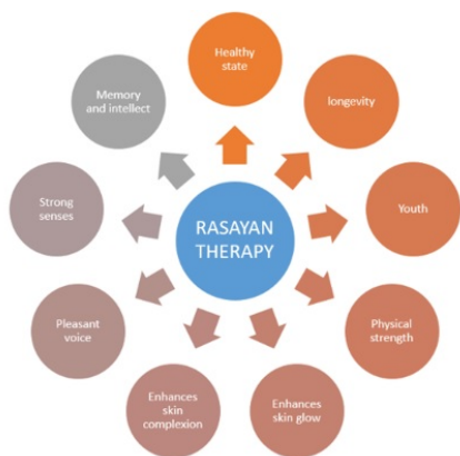
Fig. 2: Benefits of consuming rejuvenating formulations i.e. Rasayan

Omicron have sub variants including BA.1, BA.2, BA.3, BA.4, BA.5. It also include BA.1 /BA.2 recombinant form such as XE. Recently India started recording few new cases of BA.4 and BA.5, most of them have completed vaccination.