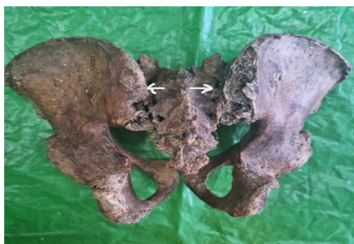
Fig. 2: Posterior superior view of pelvis: arrows indicating fused portion of sacroiliac joint