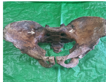
Fig. 1: Anterosuperior view of pelvis: arrows indicating fused sacroiliac joint

Joint fusion can be due to inflammation, fibrosis, calcification leading to decreased joint mobility. The process of calcification termed as biomineralisation that