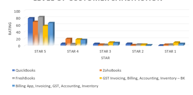
Fig. 2: Level of customer satisfaction.

percent (5 stars), span "GST Invoicing, Billing, Accounting, Inventory-BK" has the smallest extent of contentment, accompanied by 9.89 percentage (1 star). This shows that human beings favor Fresh Books when differentiated with further apps.