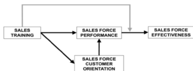
Fig. 2: Module of sale force effectiveness

Product knowledge training with relevant sales and marketing training, improves sales dynamics and thus it is conducted in quarterly cycles. Highly trained sales personnel perform better. The trained medical representative makes presentations to doctors, practice staff and nurses hospital doctors and pharmacists in the retail sector 10