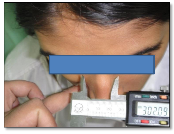
Fig. 1: Measurements taken by direct method - Intercanthal width.

view were T-Ex (tragus-exocanthion) tragus-exocanthion distance, Sa-Sba (superaurale-subaurale – Fig 2) ear length,Sn-Me (subnasale-menton) inferior facial third,N-Sn (nasion-subnasale) nose height or middle facial third, N-Prn (nasion-pronasale) nasal bridge length, Prn-Sn (pronasalesubnasale) nasal tip protrusion and Sn-Sto (subnasalestomion) upper lip height.