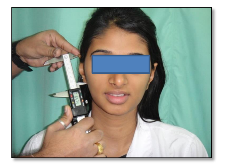
Fig. 2: Measurements taken by direct method - Sa-Sba (superaurale-subaurale).