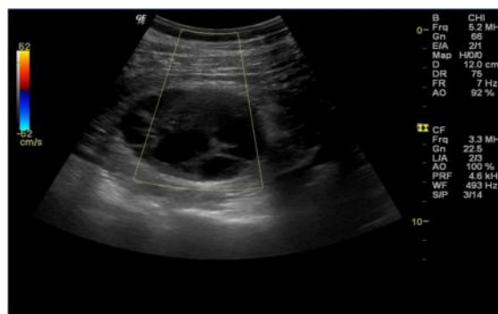
Figure 1: Multiseptated appearance of the hydatid cyst with absent color uptake on color Doppler imaging.

infestation may mimic a soft tissue tumor leading to inappropriate cyst rupture with the attendant risks of anaphylaxis and dissemination to other organs, so a preoperative correct diagnosis is important.