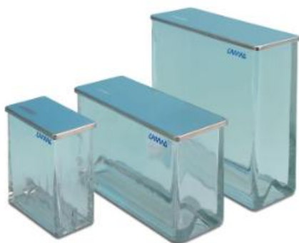
Fig. 3: Twin trough chamber

mobile phase is removed under fume cup-board to avoid contamination of laboratory atmosphere. The plate should be always laid horizontally because when mobile phase evaporates the separated components will migrate evenly to the surface where it can be easily detected.