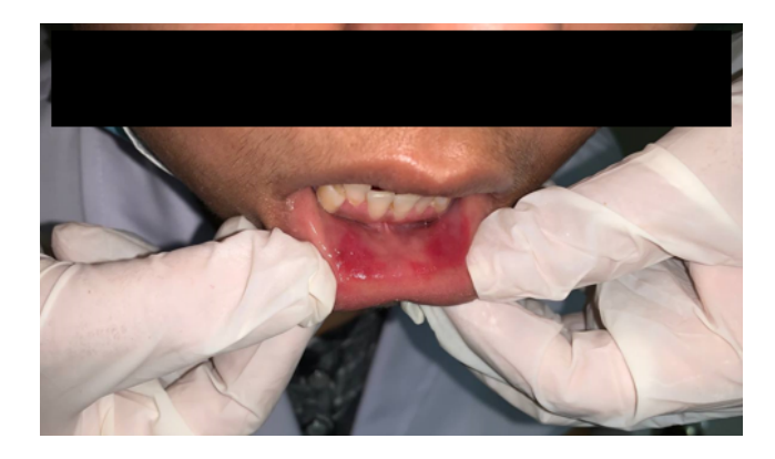
Fig. 1: Minor aphthous ulcer- erythematousprodromal burning stage

Sri Sukhmani dental college and hospital, Derabassi, SAS Nagar, Punjab.