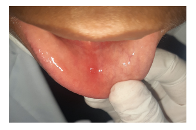
Fig. 4: Minor aphthous ulcer in healing stage