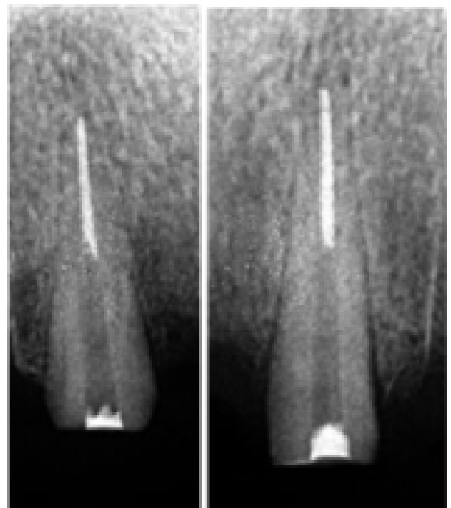
Fig. 3: Post space preparation with 4-5 mm of apical seal