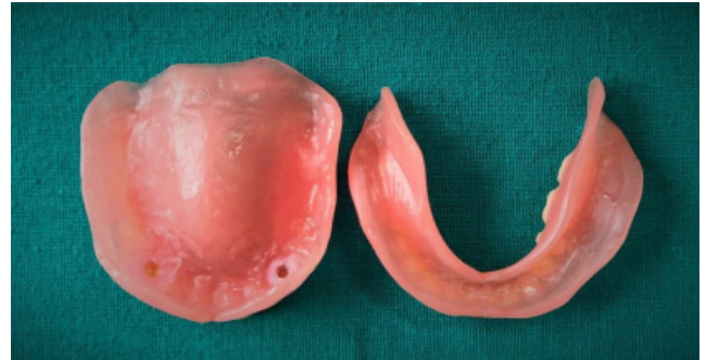
Fig. 8: Picking up of the female housing with self-cure acrylic resin