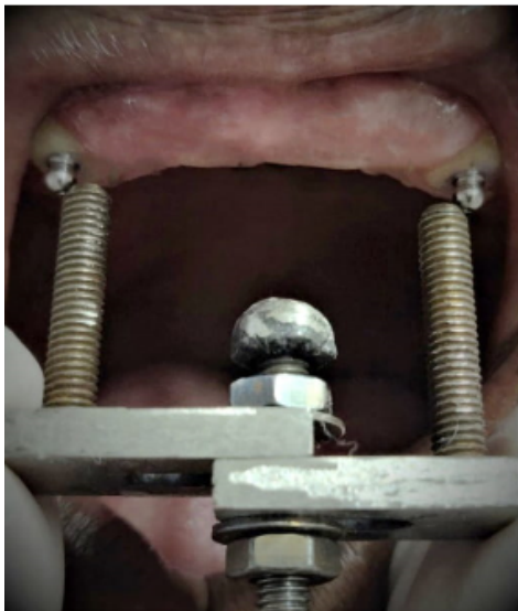
Fig. 6: Utilization of customized parallel meter