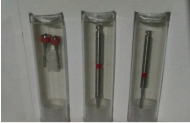
Fig. 4: EDS ACCESS post system