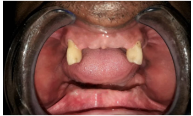
Fig. 1: Pre-Op intra oral

The prospect of losing all teeth can be very annoying for a patient. It hampers physiologic and psychologic aspects as it is an indirect reminder for being dependent on others and losing senescence. In such conditions, overdenture option as preventive prosthodontic treatment modality should be regularly imbibed because of its innumerable advantages. Crum and Rooney 3 graphically demonstrated in 5 years study, an average loss of 0.6 mm of vertical bone in the anterior part of the mandible of