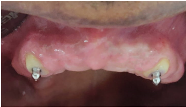
Fig. 5: Verification of attachment post for snug fit and appropriate depth