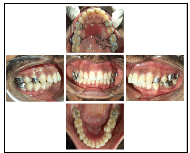
Fig. 2: Pendulum Appliance

Maxillary 1st premolars, 1st molar and 2nd molars both right and left sides were banded and Pendulum Appliance with 0.032 TMA wire was fabricated and attached (Figure 2). The appliance was activated by 90°to deliver a force of 220 grams. After the desired distalization was achieved in 2-4 months, appliance was kept in place for 2 months to retain the distalization effect, followed by placement of Nance palatal arch. Fixed mechano therapy by bonding with 0.018 MBT was initiated. Alignment and levelling in the both arches was carried out by following wire sequence: (a) 0.016" heat activated nickel-titanium arch wires (b) 0.016x0.022" nickel-titanium arch wires (c) 0.016x0.022" SS arch wires (d) 0.017×0.025" NiTi arch wires (e) 0.017×0.025" SS arch wires. The arch wires were cinched distal to molar to avoid maxillary and mandibular incisor proclination. Treatment was completed in 18 months. After debonding patient was given essix retainer and follow up was done for next 6 months.