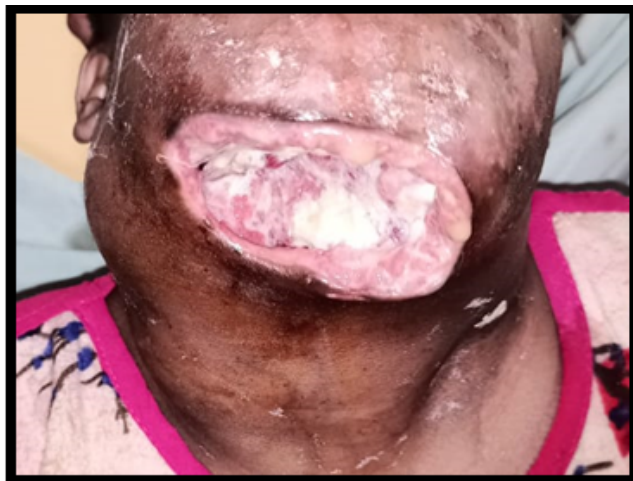
Fig. 3: Showing the lesion