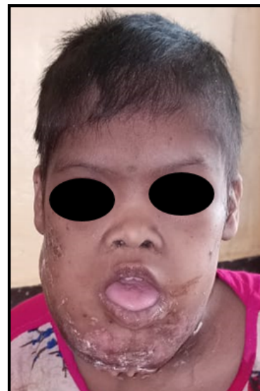
Fig. 1: Frontal view

Computed tomography revealed involvement of right mandibular body suggestive of osteomyelitic changes. An informed and written consent was obtained from the patient bystander for the procedure. FNAC report was suggestive of dysplastic changes followed by biopsy which revealed osteosarcoma. The patient was planned for mandibular resection with modified radical neck dissection and reconstruction. The patient was discharged against medical advice and she has passed away after two weeks.