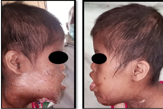
Fig. 2: a,b – Lateral view