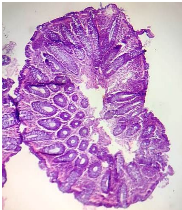
Fig. 1: Showing an adenomatous polyp with tubular architecture (H&E Stain 100X).

Most of the polyp showed no dysplasia (94.64%). The dysplasia were seen more in adenomatous polyp showing high grade dysplasia in form of nuclear stratification and broadening of nuclei with equal proportion both in tubular adenoma and tubulovillous adenoma.