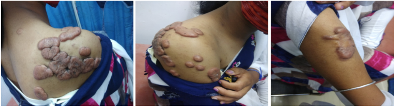
Fig. 1: Clinical pic showing multiple scars in the shoulder, upper arm and forearm.