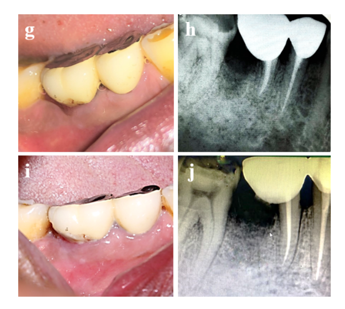
Fig. 3: g: Review after one month: clinical pic; h: Review after one month:IOPA; i: review after one year: clinical pic; j: review after one year:IOPA