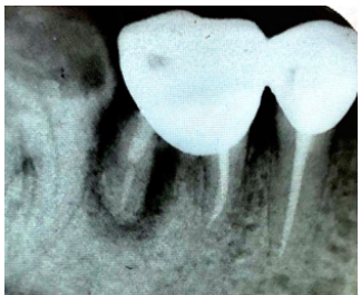
Fig. 1: Pre - OP