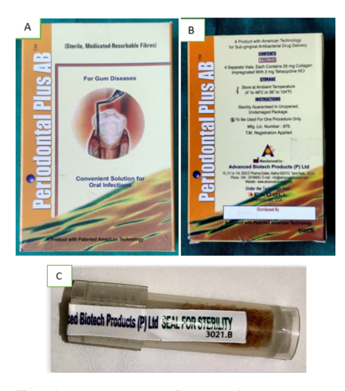
Fig. 1: A: Periodontal Plus AB; B: content of local drug delivery tetracycline fibre; C: tetracycline fibre container with fibre