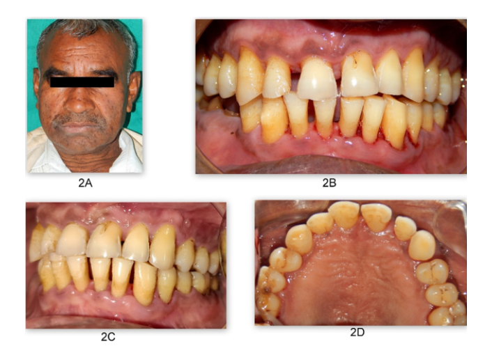
Fig. 2: A: Facial View: swelling resolved on below the left eye; B: Frontal view periodontal abscess wrt 21,22,23 and gingivitis were resolved; C: lateral view periodontal abscess resolved wrt 21,22,23; D: Palatal View Palatal swelling resolved.