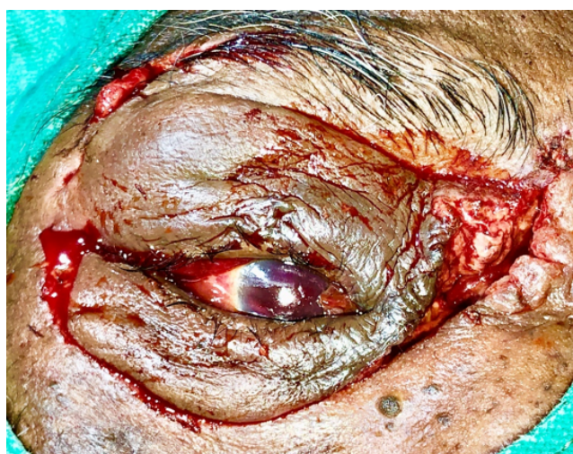
Fig. 6: Cow hoof injury causing right eye periocular laceration with closed globe injury.