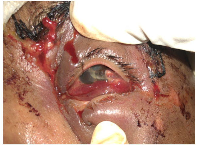
Fig. 4: Photograph showing left eye multiple laceration of lower eyelid and periocular area with globe rupture due to cat claw injury.

Cattle and bulls are commonly domesticated animals worldwide. Since ox, cow, and buffalo are docile compared to the bull hence bull can easily be raged. Humans can