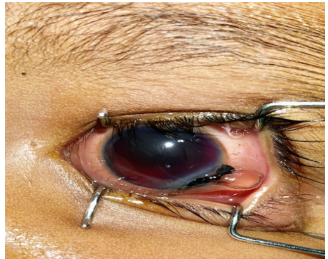
Fig. 9: Bird (crow) pecking injury in young boy showing corneal laceration with prolapse of uveal tissue and vitreous.