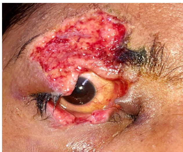
Fig. 2: Dog bite related severe laceration of both eyelid of right eye.