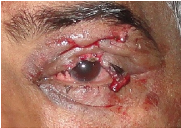
Fig. 8: Monkey bite causing left upper eyelid laceration involving lid margin