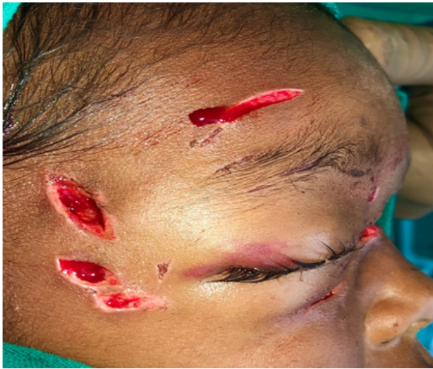
Fig. 3: Photograph of young boy having dog bite injury showing multiple oculo-facial laceration & puncture wound

Cat scratch inflicted ocular injuries are relatively rare, and published case reports are scanty. Cariello et al. reported that 0.4% of ocular injury victims attending the emergency department were due to cat bites and cat scratches. 31 Young children are prone to cat scratch inflicted injury.(Figure 4) Several cases of cat-scratch-inflicted corneal laceration have been reported from USA 32-34 and France. 32 Cat inflicted open globe injury in children ranged from 1.2% 33 to 2.5%. 34 Cat induced full-thickness corneal laceration has been reported by Chang and Peiris et al. 35,36 Two cases of scleral perforation with eyelid laceration without corneal laceration due to cat bite has been reported. 37,38