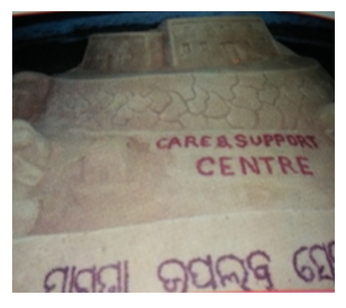
Fig. 2: (SAND ART in Odia language)