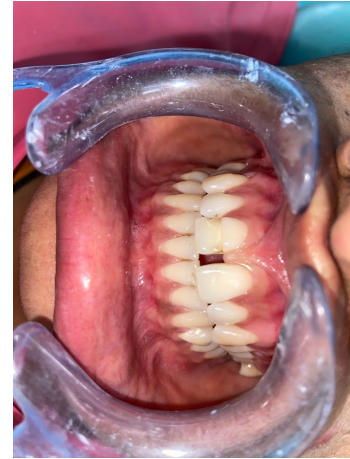
Fig. 2: Pre-operative image

using a layering approach. Each layer received 40 seconds of face and lingual light curing for each layer. The gingival embrasure region was given extra consideration in order to create the required proximal contour. Using a low speed handpiece, polishing discs were utilised for meticulous polishing of coarse to fine grains.