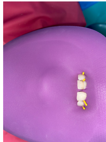
Fig. 3: Rubber Dam isolation was done using flexidam