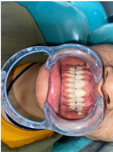
Fig. 5: Post-operative view after the procedure

the intraoral examination. About half of the clinical crown length had enamel hypoplasia.