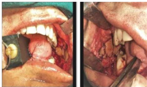
Fig. 6: Adaptation of Nasolabial flap intra-orally