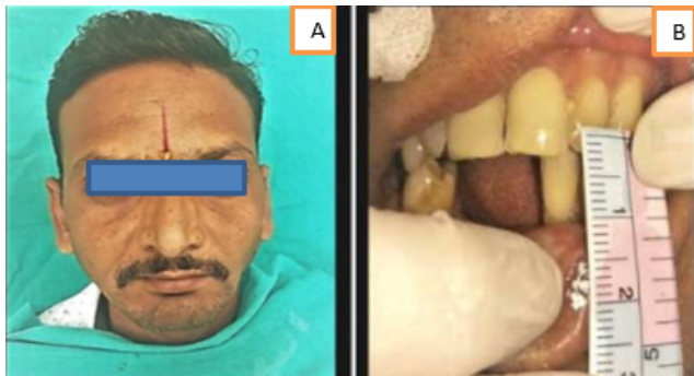
Fig. 1: Pre operative (a); Front view (b); Mouth opening

The study was carried out in the Department of Oral & Maxillofacial Surgery, Modern Dental College & Research Centre, Indore. 10 medically fit patients were chosen for the study. All these patients had a chief complaint of restricted mouth opening (interincisal distance less than 10 mm). Thus, all the cases were diagnosed as advanced oral submucous fibrosis based on long standing positive history of habits (chewing betel nut, tobacco, etc.), clinical examination and histopathological examination. Each patient's age, sex, etiology, history of habits, and preoperative mouth opening were documented (Table 1) Routine hematological investigations and radiographs were done for all patients. Patients were followed regularly for six months and maximum interincisal distance was measured (Table 3)