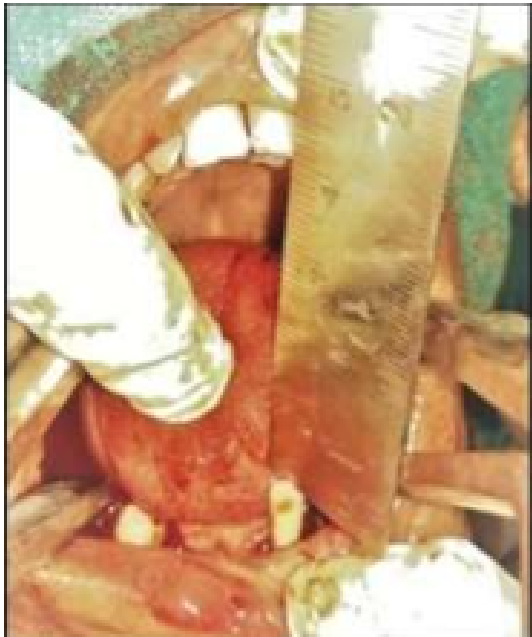
Fig. 2: Intra-operative mouth opening