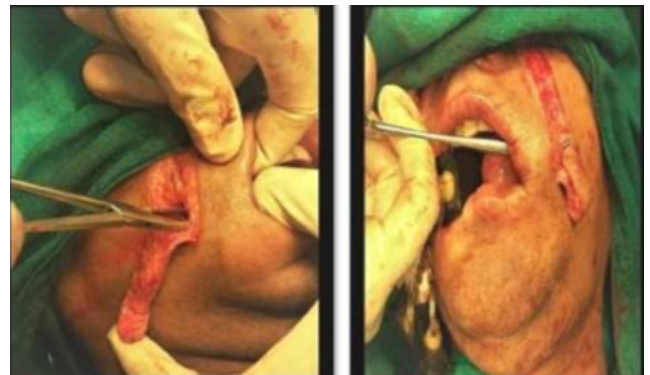
Fig. 5: Transbuccal tunneling of Nasolabial flap