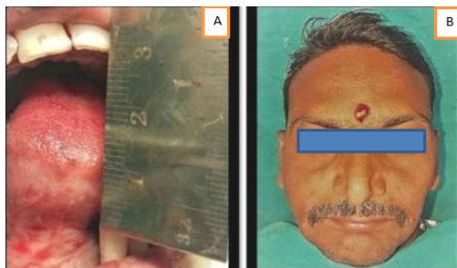
Fig. 8: Post-Operative Mouth opening (6 months) a; Mouth opening b; Front view

Surgical Technique: A total of ten cases of OSMF were undertaken for the study of which one case is shown (Figure 1). After informed consent surgical procedures were carried out under general anesthesia wherein the patients were intubated using the awake blind nasal technique or fiberoptic intubation under antibiotic coverage. The intraoral incisions to release the fibrous bands were made using electro-surgical knife along the buccal mucosa at the level of occlusal plane away from Stenson's duct orifice. Incision began 1 cm behind the corner of the mouth and extended posteriorly up to the anterior faucial pillars and soft palate. Undermining of the wound margins were done by blunt dissection until no resistance was felt.