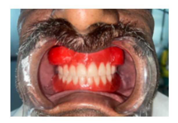
Fig. 2: Moulding of plumper.