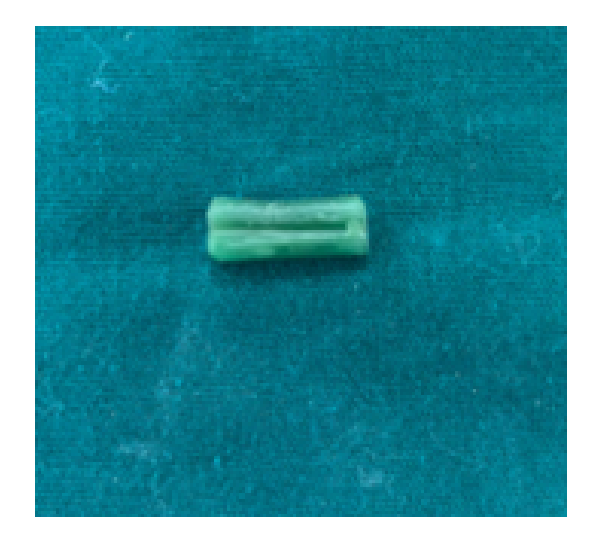
Fig. 3: Sprue wax attachment.