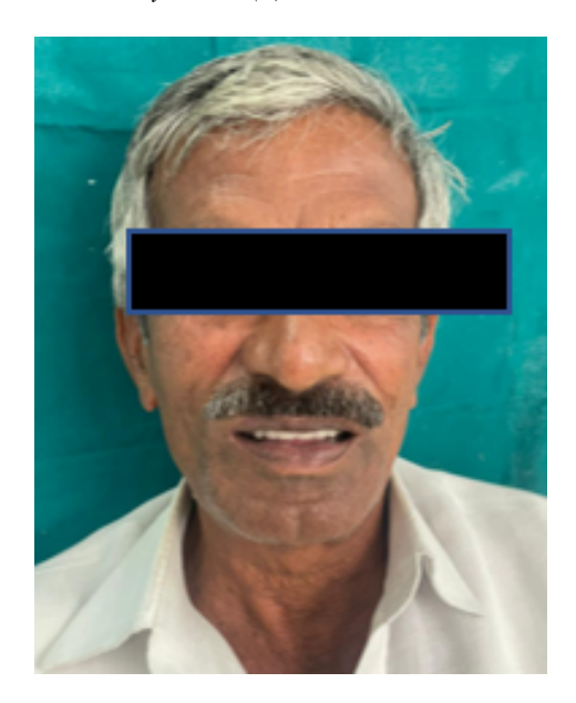
Fig. 6: Post operative