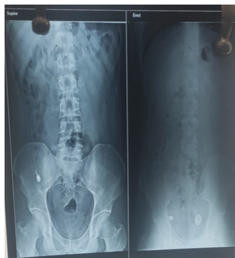
Fig. 2: DAY 2: Abdominal radiograph (supine and erect position)