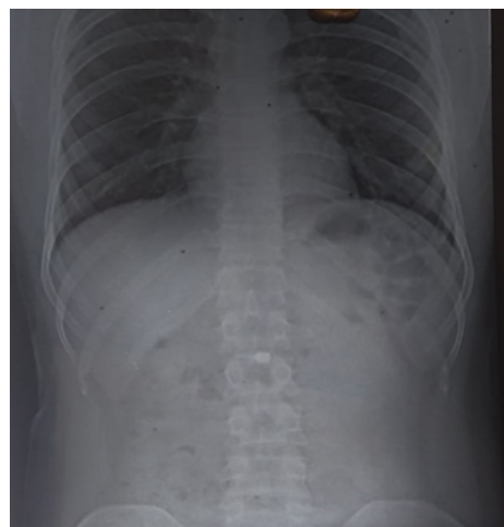
Fig. 1: DAY 1: Abdominal radiograph

During the dental procedure, if a foreign object is lost in the oropharynx when the patient is in the supine position,