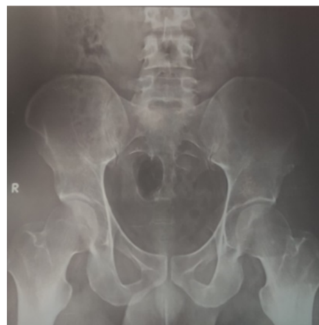
Fig. 3: Day 5: Pelvic radiograph